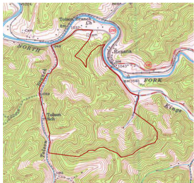
Roxana Site Location

In accordance with NEPA, alternatives that meet the purpose and need for the Proposed Action, avoid and (or) minimize impacts to the environment, and are technically and economically feasible have been considered in the new DEIS. This includes a decision not to proceed with the Proposed Action (the No Action Alternative) and to proceed with the Proposed Action at the Roxana Site.