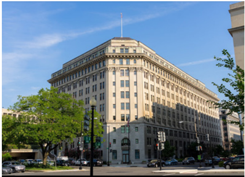
Federal Bureau of Prisons Headquarters, Washington, D.C.

Since its establishment in 1930, the FBOP's overarching responsibility has been to provide for the care of the population of federal adults in custody (AIC) while maintaining safe and secure facilities that ensure the well-being of AIC, employees, and the public at large. Today, the FBOP manages 122 institutions comprising 66 million square feet of space on 46,000 acres of land including all aspects of facility repairs and maintenance involving interior and exterior finishes, roofs, perimeter fences and other security measures, mechanical, electrical, plumbing, lighting, and utility systems, communication equipment, and fire protection and life safety systems.