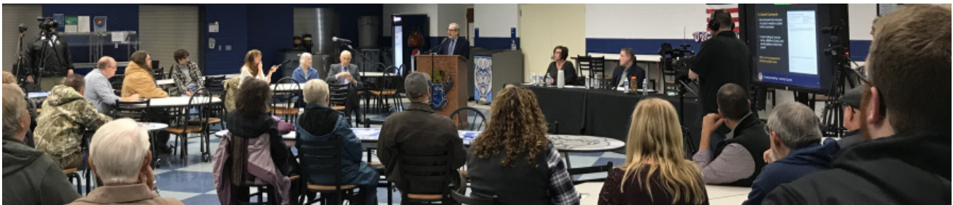
Public Scoping Meeting, November 17, 2022

Public outreach and engagement is a key component of the environmental planning and review process, ensuring that public concerns and issues are identified and addressed in the new DEIS. Therefore, the FBOP published a Notice of Intent to prepare a DEIS for the proposed FCI and FPC in Letcher County, Kentucky in the Federal Register on September 28, 2022. Coinciding with publication in the Federal Register, similar notices were also published in the Mountain Eagle and Letcher Community newspapers and again in advance of the public scoping meeting. Following publication of a Notice of Intent to Prepare a DEIS, the FBOP commenced the public scoping process to identify issues and possible alternatives for consideration in the DEIS. As part of the process, the FBOP held an in-person and virtual public scoping meeting at Letcher County Central High School in Whitesburg, Kentucky on November 17, 2022.